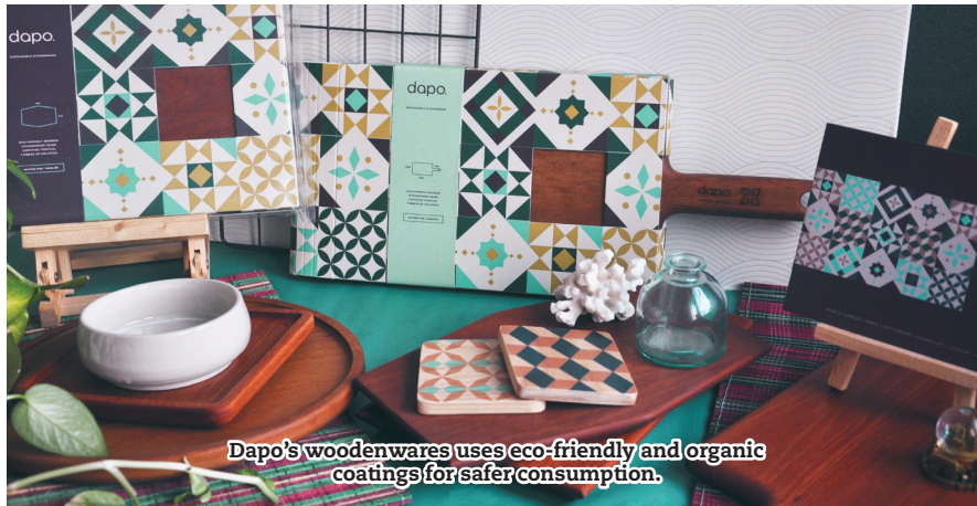
Dapo's woodenwares uses eco-friendly and organic coatings for safer consumption.

One Tech started out as typical manufacturing business but ventured into sustainable, green furniture and interior design and never looked back. Today, their environmentally friendly products are taking the Malaysian and International market by storm.