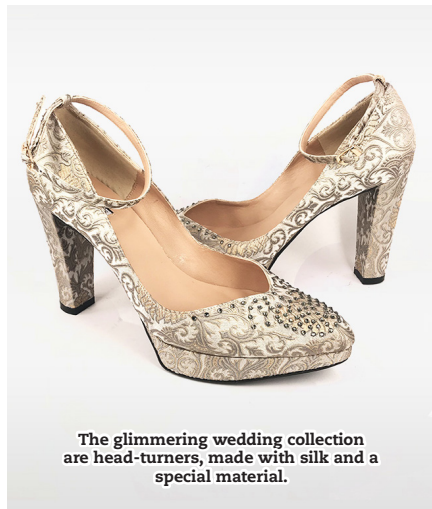
The glimmering wedding collection are head-turners, made with silk and a special material.

Whether one is standing, walking or working in offices or on sales floors, in air or at fine dining restaurants, NTH Global's Nottingheels shoes will keep them in comfort and in style.