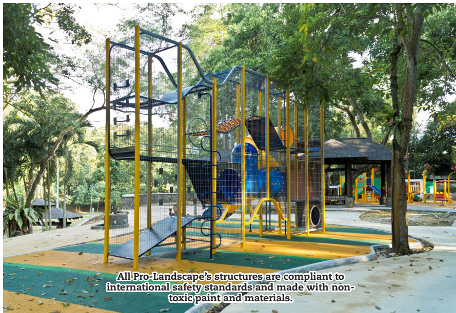
All Pro-Landscape's structures are compliant to international safety standards and made with non-toxic paint and materials.

Landscaping for parks and recreational areas since the year 2000, Pro-Landscape Structure Sdn Bhd has expanded their arsenal of skills, products and services to cover over 10,000 projects across the globe.