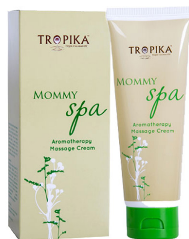
The Aromatherapy Massage Cream is a blend of traditional home remedies for postpartum recovery.

Having many feathers in their cap, and backed by a strong market presence throughout Western Asia and China, TROPIKA maintains a respectful and trustworthy persona. The company's purpose is to enhance the quality of life and contribute to a healthier future. It strives for the best to provide customers with all-natural and safe products.