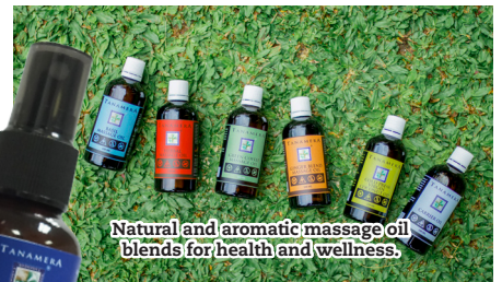
Natural and aromatic massage oil blends for health and wellness.