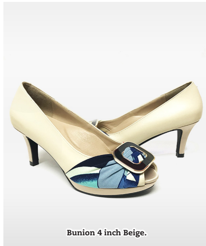
Bunion 4 inch Beige.

From Nottingheel's collection, it is clear to see that their heart lies in the comfort of their customers - striving to design and provide the best for customers' foot care and overall health.