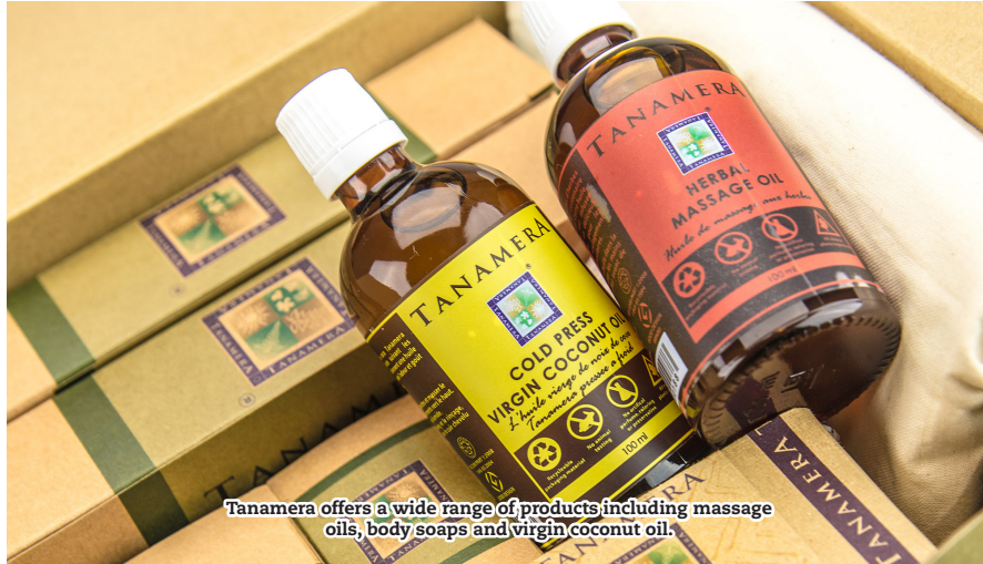
Tanamera offers a wide range of products including massage oils, body soaps and virgin coconut oil.

Taking advantage of Malaysia's rich natural resources, Tanamera has carved out a name for itself as a purveyor of quality personal care products made from tropical, natural ingredients.