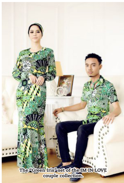
The "Green Iris" set of the IM IN LOVE couple collection.

Promising a collection that uses highly refined quality fabrics, good craftsmanship, the most competent professionals and the latest technology in the fashion industry, Norish Kareem Couture has captured the hearts of international audiences.