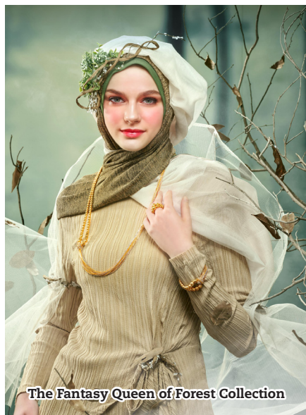
The Fantasy Queen of Forest Collection

Tomei beckons us into its tantalising world of jewellery of fine lines and fantastic forms.