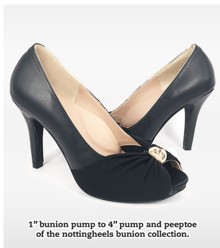
1" bunion pump to 4" pump and peep toe of the nottingheels bunion collection.

D RIVEN by her desire for better, healthier and more fashionable footwear, Amy Chiew - a renowned Malaysian entrepreneur - founded the Nottingheels brand to remix style with comfort for women and men across businesses and industries.