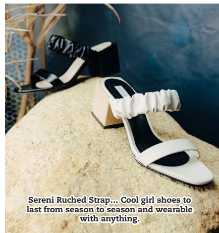
Sereni Ruched Strap... Cool girl shoes to last from season to season and wearable with anything.

Furthermore, the company goes one step further as to screen suppliers for negative social and environmental practices. Nelissa Hilman ensures every aspect of the business – down to their supply chain – becomes wholly sustainable. If there is a way to a customer's heart, it is the Nelissa Hilman brand which prioritises customer's comfort without compromising style.