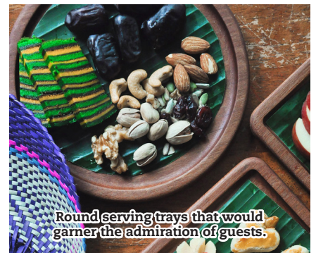
Round serving trays that would garner the admiration of guests.

The company will continue to deliver innovations that centres customers' wellbeing and engage with various communities to educate and create awareness on the importance of sustainable living.