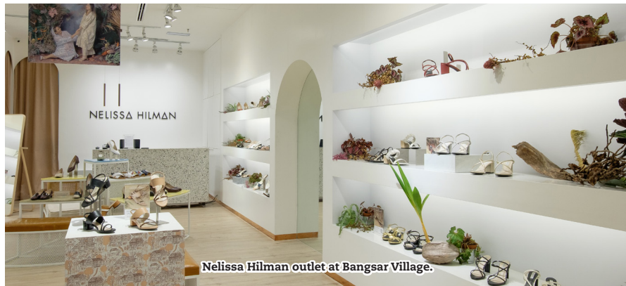
Nelissa Hilman outlet at Bangsar Village.

Nelissa Hilman blends two seemingly opposing aspects in footwear – style and comfort. Their extensive collections promise the right pair for even the most finicky of customers.