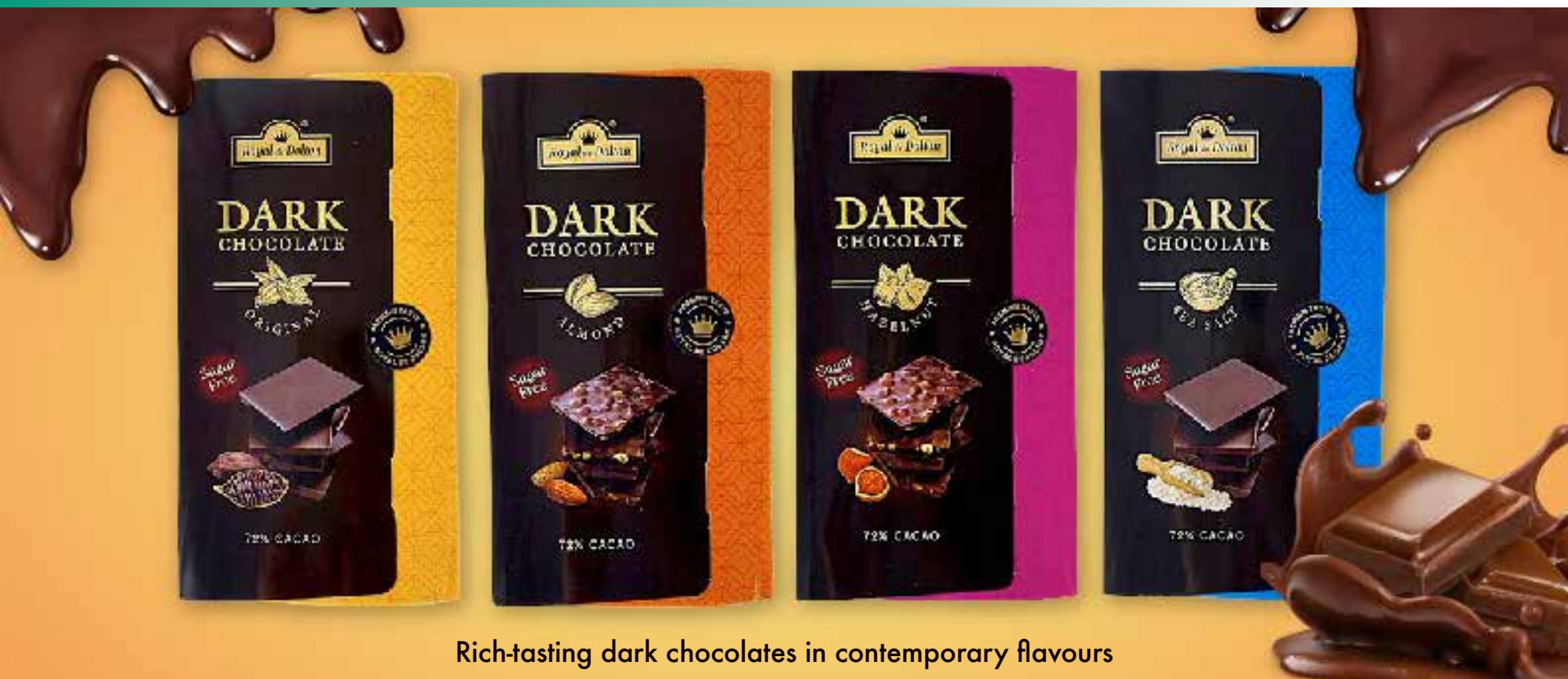
Rich-tasting dark chocolates in contemporary flavours