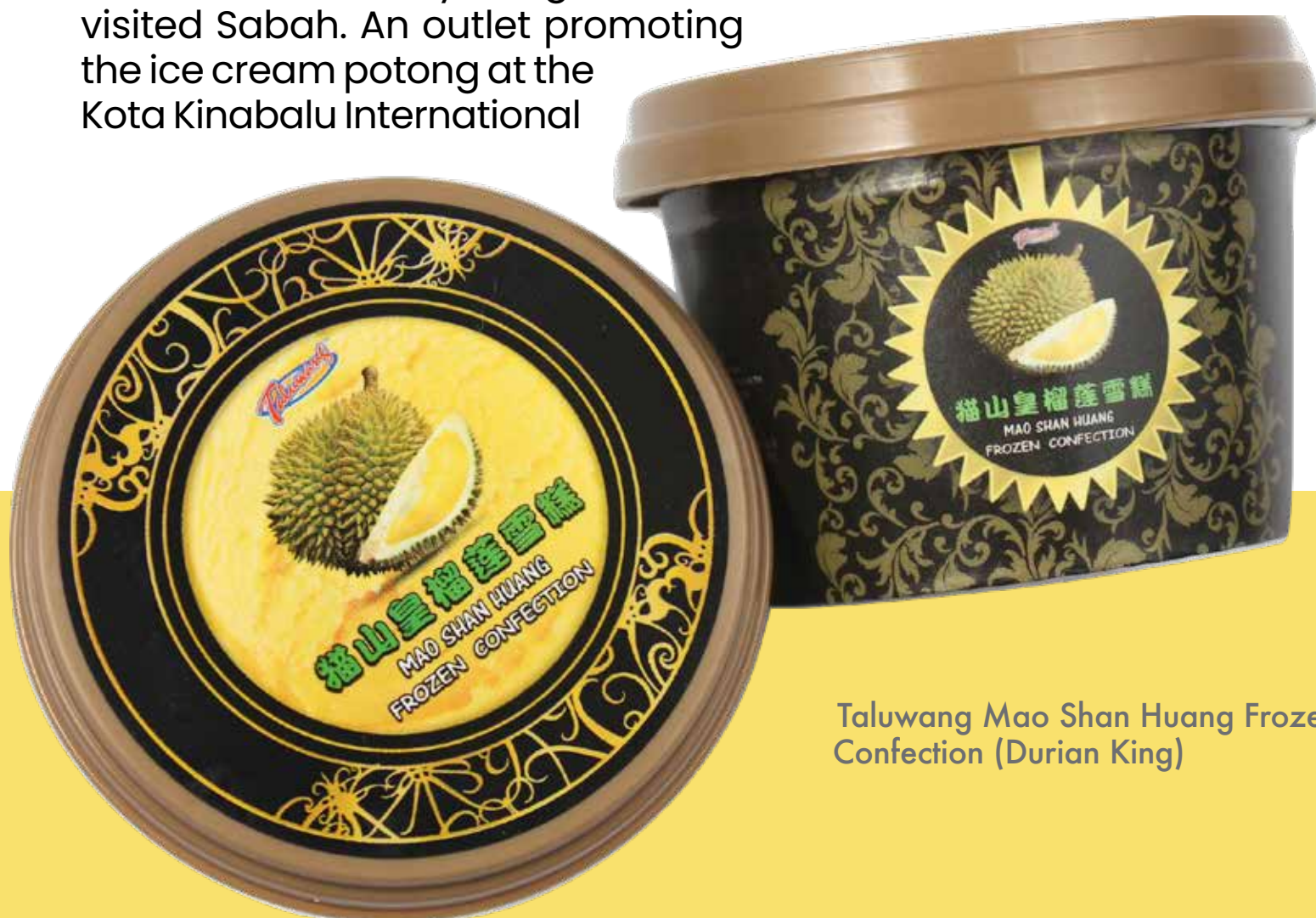
Taluwang Mao Shan Huang Frozen Confection (Durian King)

Taluwang currently offers ice creams (Assorted Frozen Confections) with multiple form factors and flavours. Each form factor/size is identified with its unique branding namely, Scupz, Stubz, Skoopz, Super Ice-Cream Potong and Super Mini Ice-Cream Potong. These sizes are all available with different fruit flavours.