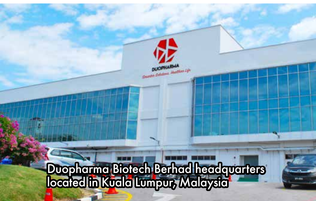
Duopharma Biotech Berhad headquarters located in Kuala Lumpur, Malaysia

The company has also diversified into the biosimilars space with technology and commercialisation collaborations with credible and robust global partners.