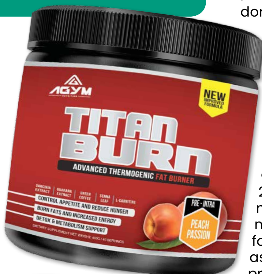
Titan Burn (Peach)

In the year 2020, the global halal food market reached a value of US$ 1.9 Trillion (Halal Food Market: Global Industry Trends, Share, Size, Growth, Opportunity and Forecast 2021-2026, Imarc Group). While nutritional and supplement is a niche market, it has tremendous potential for growth. Agym sees this growth as an opportunity to capitalise by providing quality Halal products for their customers.