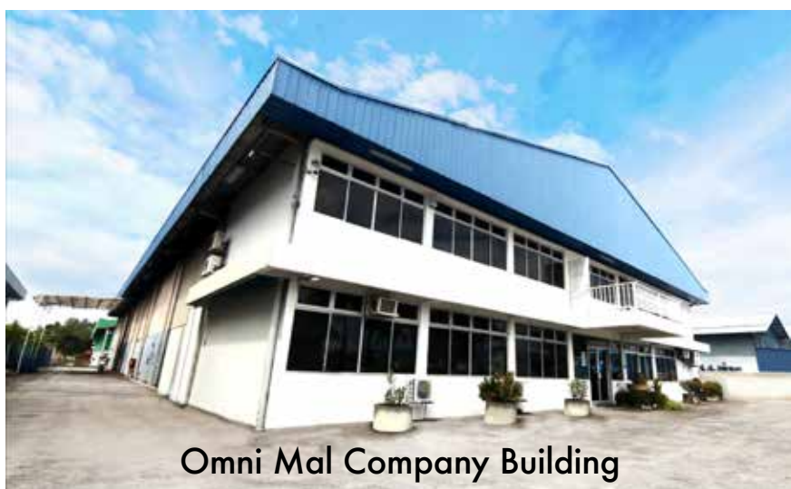
Omni Mal Company Building

Marketed under "Gurun Emas", "Date-Licious" and "Jendela Arab", Omni Mal