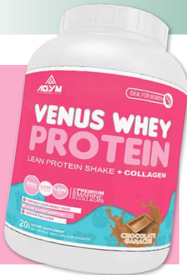
Venus Whey (Chocolate)