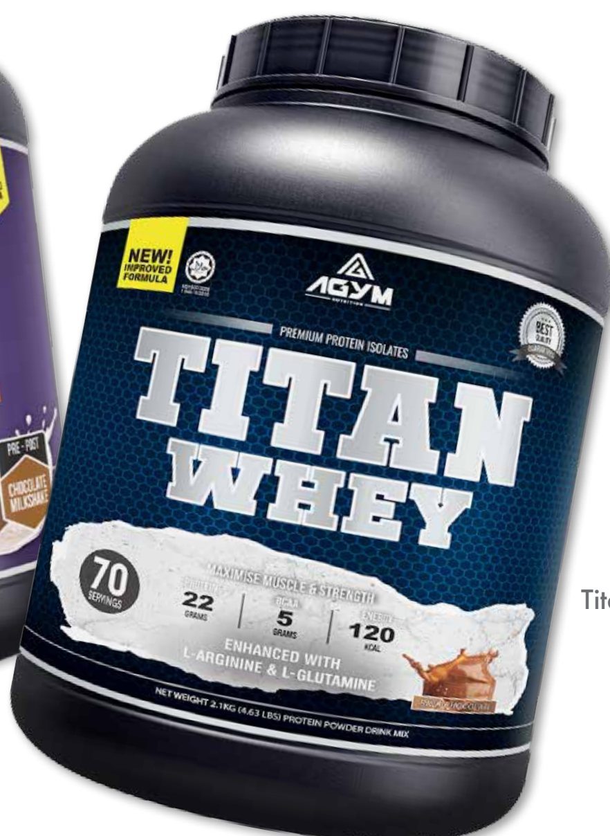
Titan Whey (Chocolate)