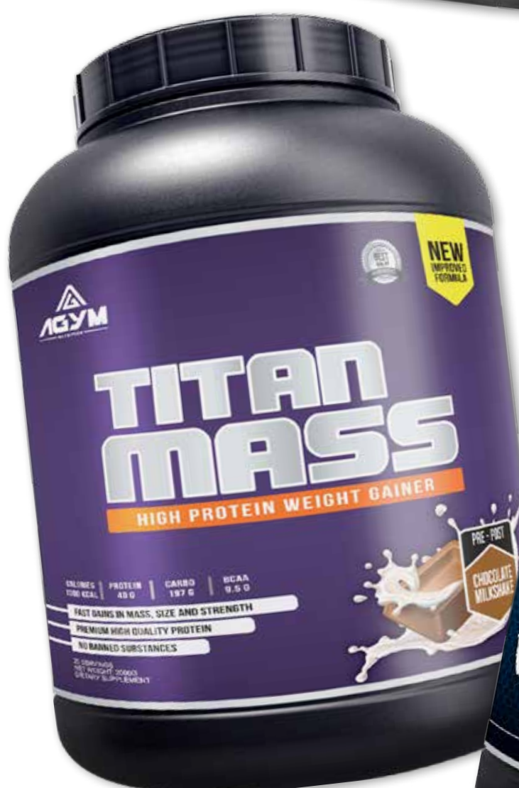
Titan Mass (Chocolate)