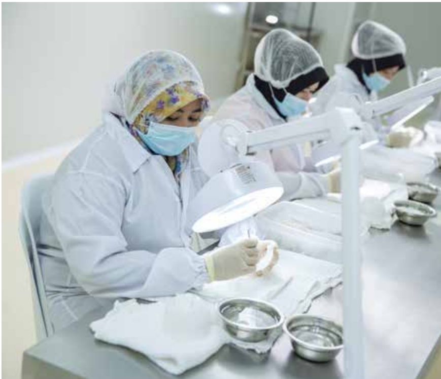
The processing of Kowalit Bird's Nest is done in a certified cleanroom to prevent contamination

without compromising the nutrition, its bird's nest processing is done following the highest standard operating procedure from receiving customer orders right up to final distribution. In addition, the processing of KOWALIT® Bird's Nest is done in a certified cleanroom to prevent contamination and comply with all regulations set by respective regulatory bodies.