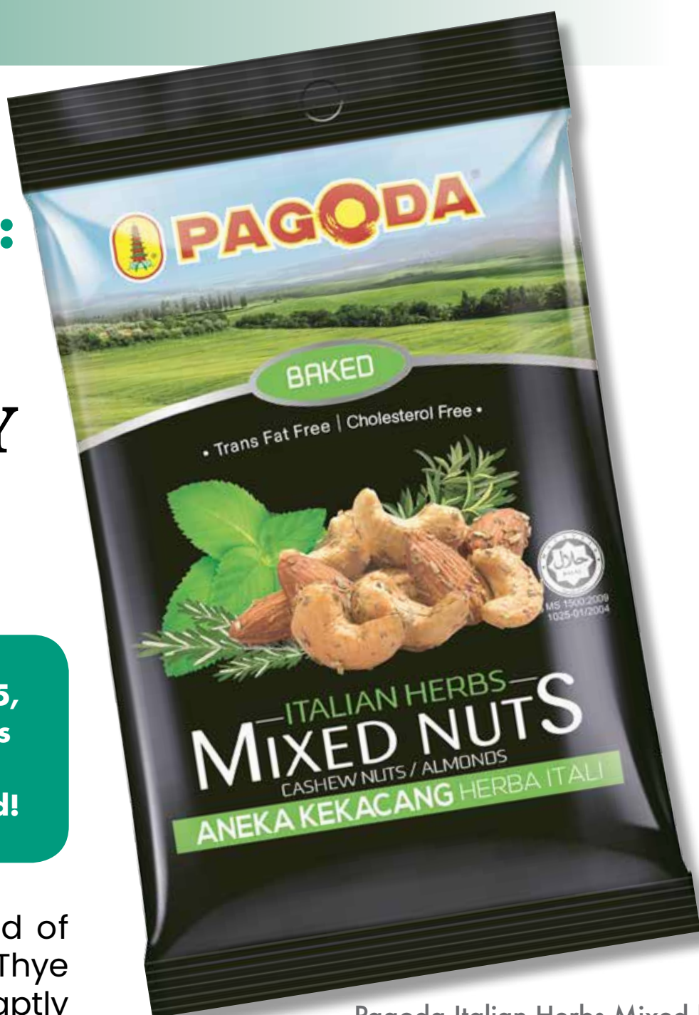
Pagoda Italian Herbs Mixed Nuts 90g

Today, Pagoda Foods has over 55 SKUs of Pagoda brand nuts products with various flavours and packaging in big and small aluminium foil pack as well as composite can pack.