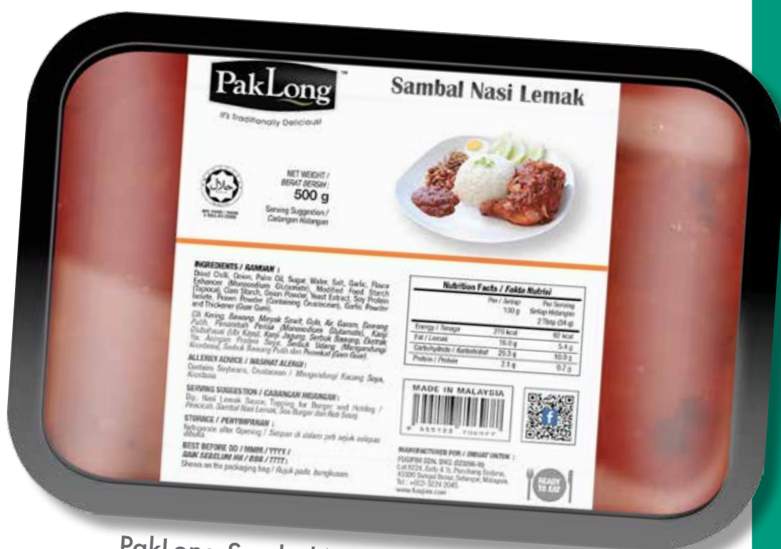
PakLong Sambal Nasi Lemak 500g