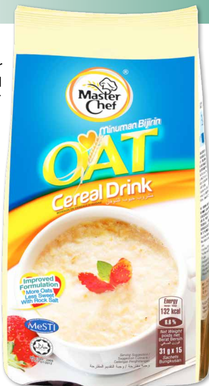
MasterChef Oat Cereal Drink (Natural)

Apart from producing their own branded products, Farmers River also supplies contract manufacturing services for OEM customers targeting specialty coffee, tea and chocolate beverages.