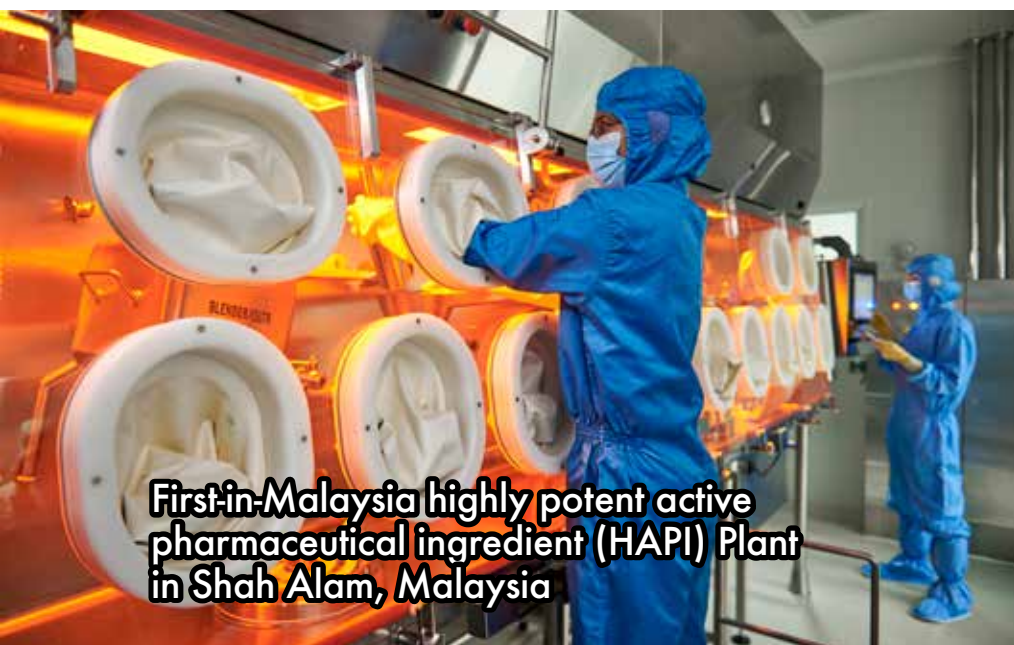
First-in-Malaysia highly potent active pharmaceutical ingredient (HAPI) Plant in Shah Alam, Malaysia