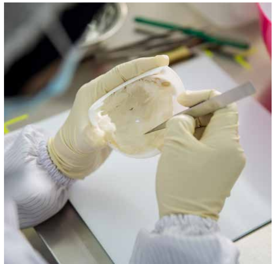
The nests are meticulously cleaned

Moving forward, the organisation aspires to promote and establish its exciting line of products to a broader global market covering the Middle East, Europe, Asia and African countries on top of its focus on the China market. In the pipeline are plans to develop more varieties of downstream products based on bird's nests such as food, supplement and skincare.