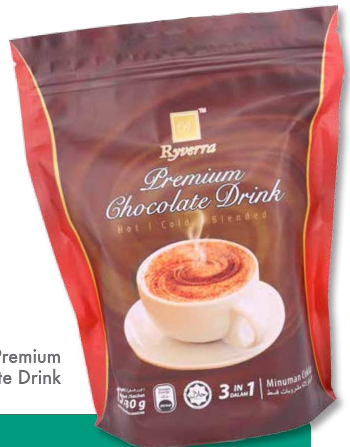
Ryverra Premium Chocolate Drink

Under Malaysia's New Exporters Development Programme, it has already achieved its milestone to promote the Ryverra brand internationally and create increased demand for its products. It's looking forward to becoming a major supplier of halal chocolate products in the region. Its vision is to enter the world marketplace with its distinctive product range.