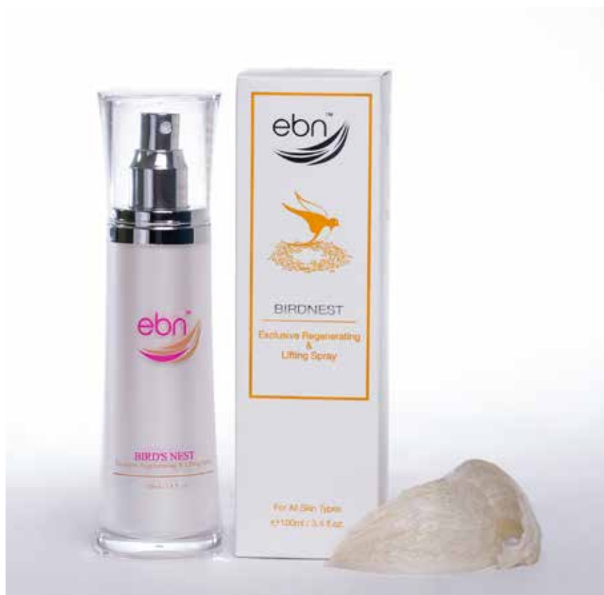
ebn® personal care series is innovated by using Prebiopep®