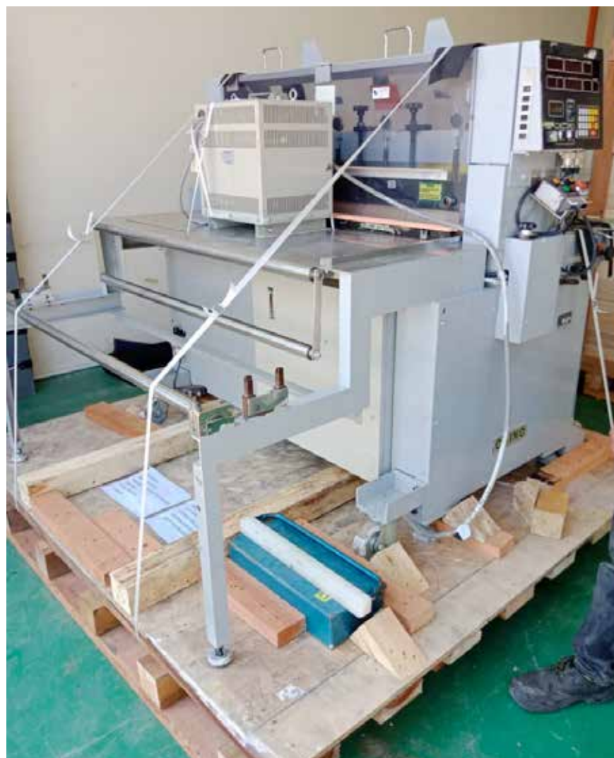
Packing and Movers Services

services in this sector and wants to position itself as a leader. To this end, ATGL is working with numerous global partners and, simultaneously, is looking into new partnerships to strengthen its offerings.