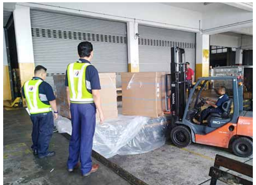
Port and Customs Clearance Services

Malaysia is in a strong position to support this industry. Malaysia has been named among the top ten attractive nations to logistics providers, freight forwarders, shipping lines, air cargo carriers and