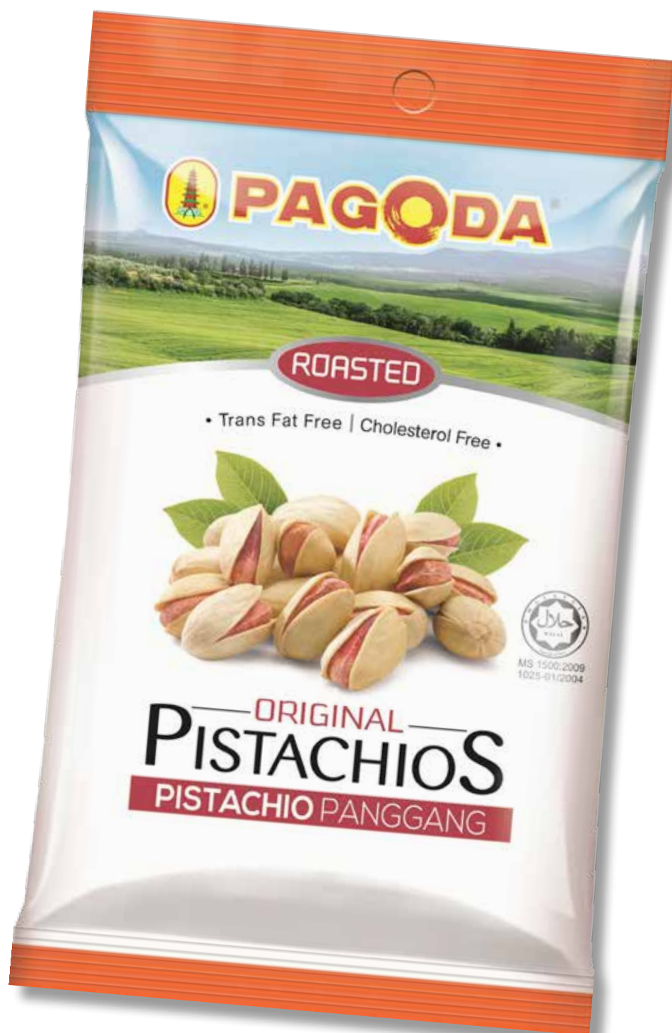
Pagoda Roasted Pistachio 80g