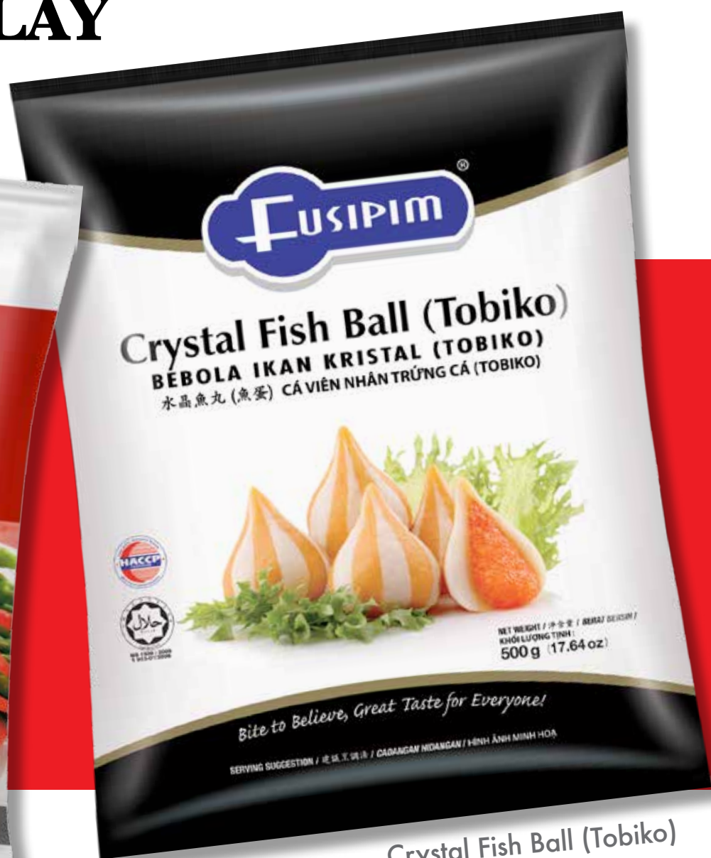
Crystal Fish Ball (Tobiko)