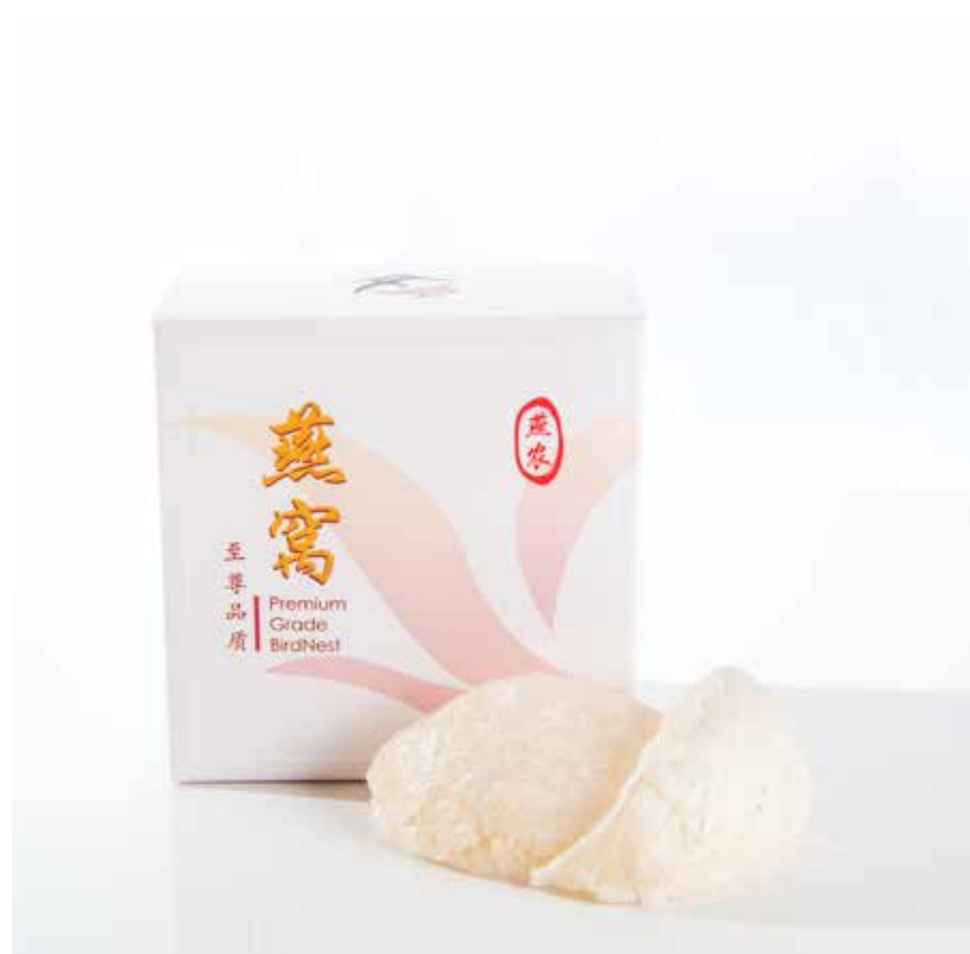
Bird's nest is consumed to maintain health and beauty