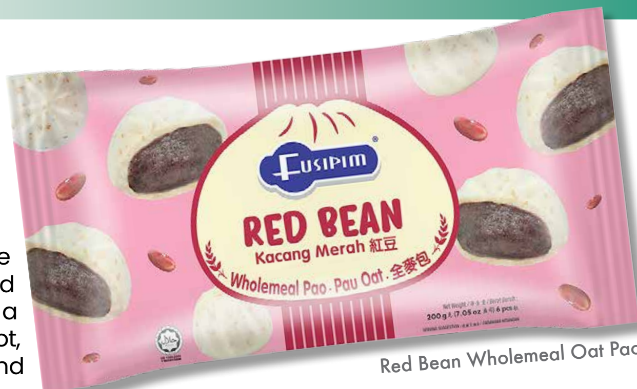
Red Bean Wholemeal Oat Pao

Fusipim exports its products to more than 15 countries, including the USA, Canada, Japan, Australia, New Zealand, Singapore, Brunei, Indonesia, Vietnam, Philippines, Timo Leste, Hong Kong,