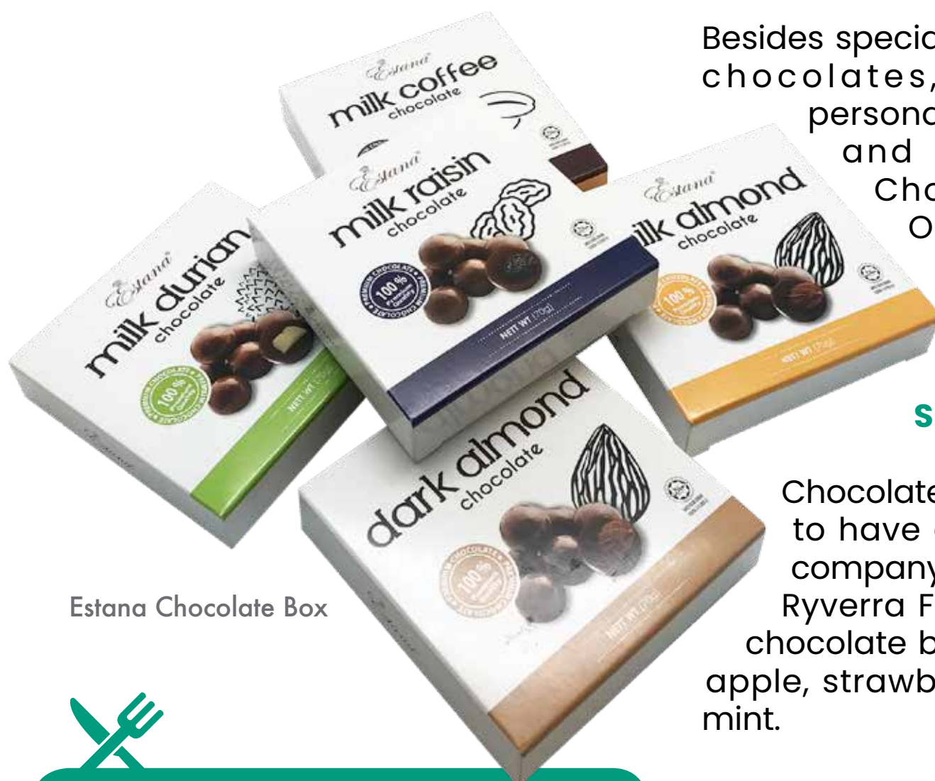
Estana Chocolate Box