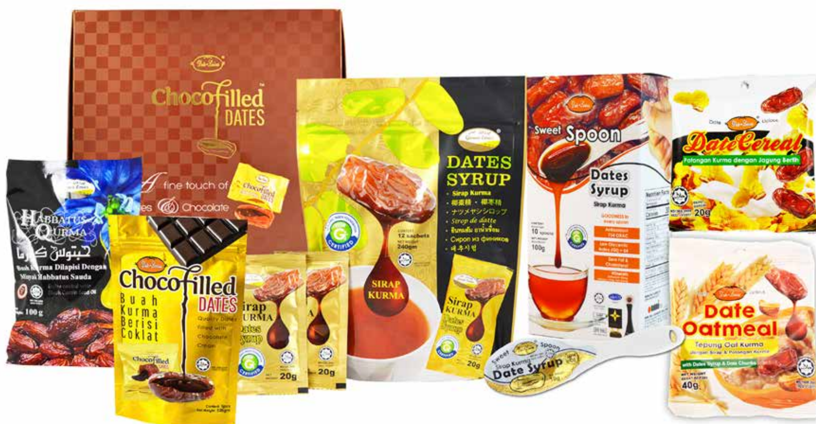
Delightful Omni Mal products with value-added properties