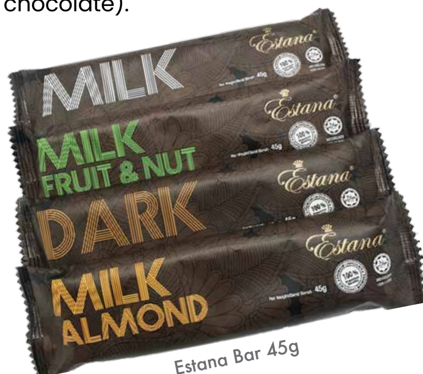
Estana Bar 45g

The other premium products are Mendiants, Marsarilla, Assorted Truffle, Assorted Truffle & Chocolate, and Assorted Praline Chocolate. And under the Estana brand are assorted bars (milk; milk, fruit & nut; dark; almond milk); and Estana Chocolate Box of panned chocolates (almond, raisin, coffee, durian coated with milk/dark chocolate).