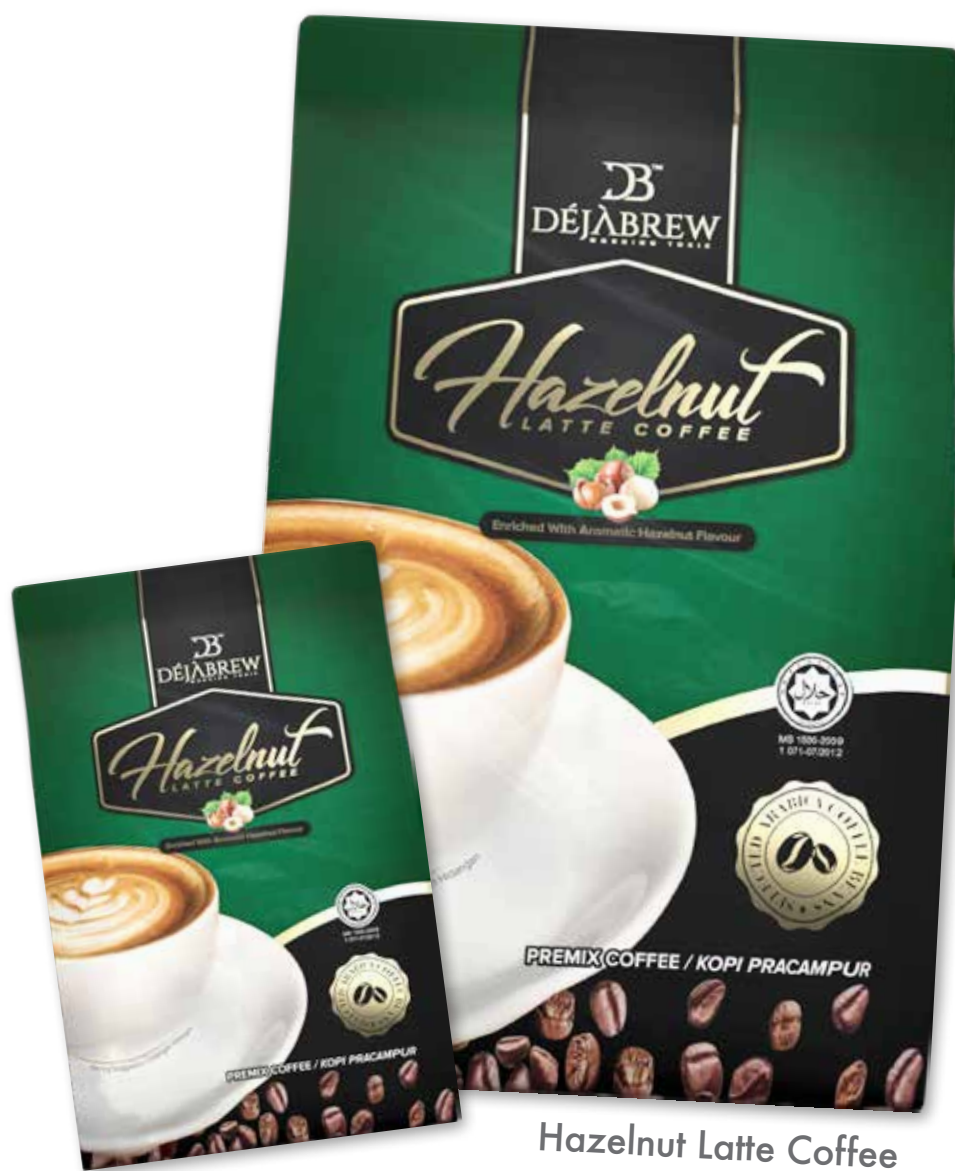
Hazelnut Latte Coffee

Thus, oatmeal plays an active role in helping the body safeguard against chronic diseases, such as heart disease, diabetes, and cancer. Moreover, oatmeal is an excellent food for a hectic lifestyle since it is easy to cook and fulfils the body's daily nutritional requirement. Generally, oatmeal is enjoyed with fruits, berries, nuts, and milk.