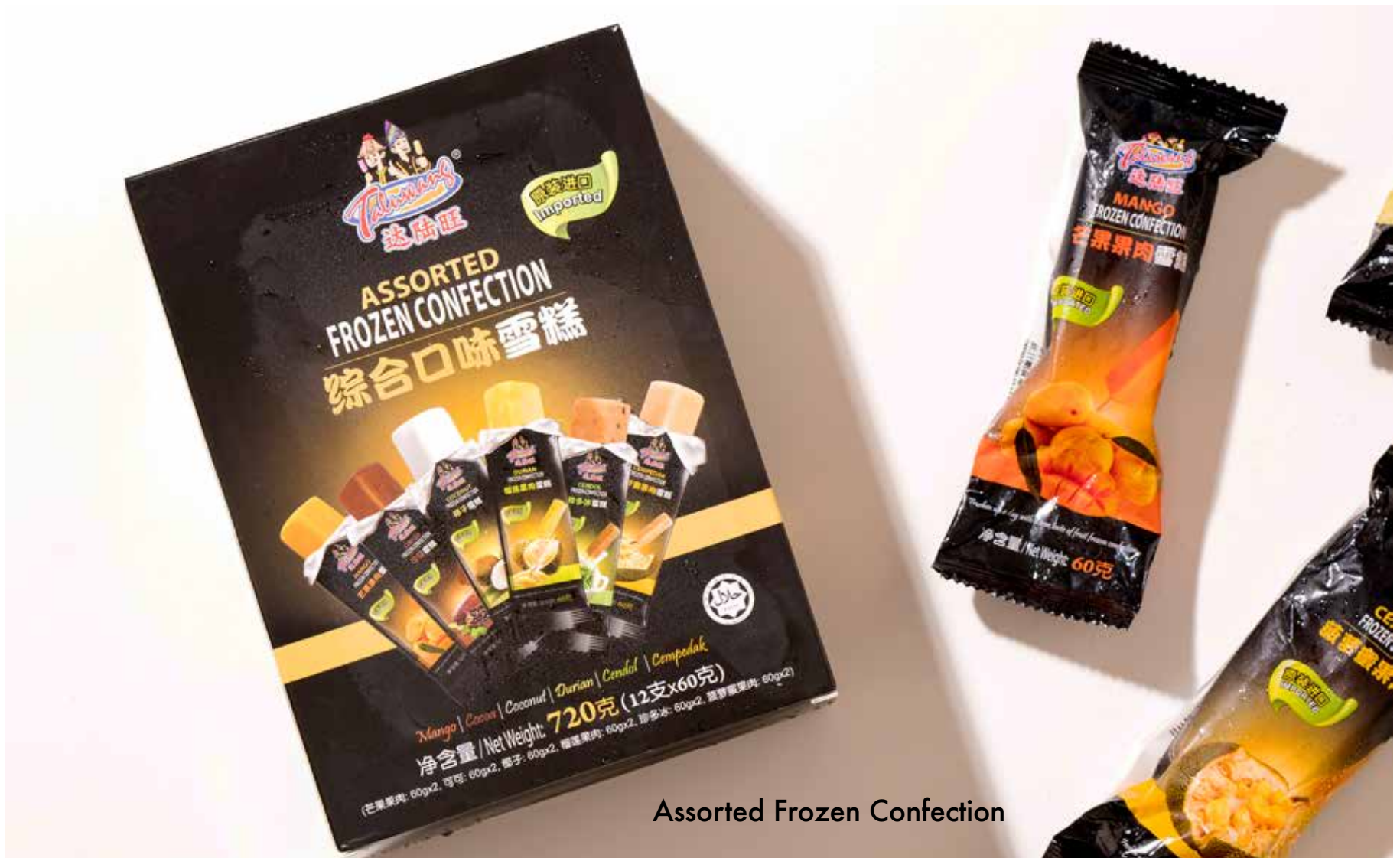
Assorted Frozen Confection

Apart from these products, Taluwang also supplies a premium ice cream (Taluwang Mao Shan Huang Frozen Confection) made from fresh Musang King Durian meat. Musang King is a premium and the most famous among durian varieties.