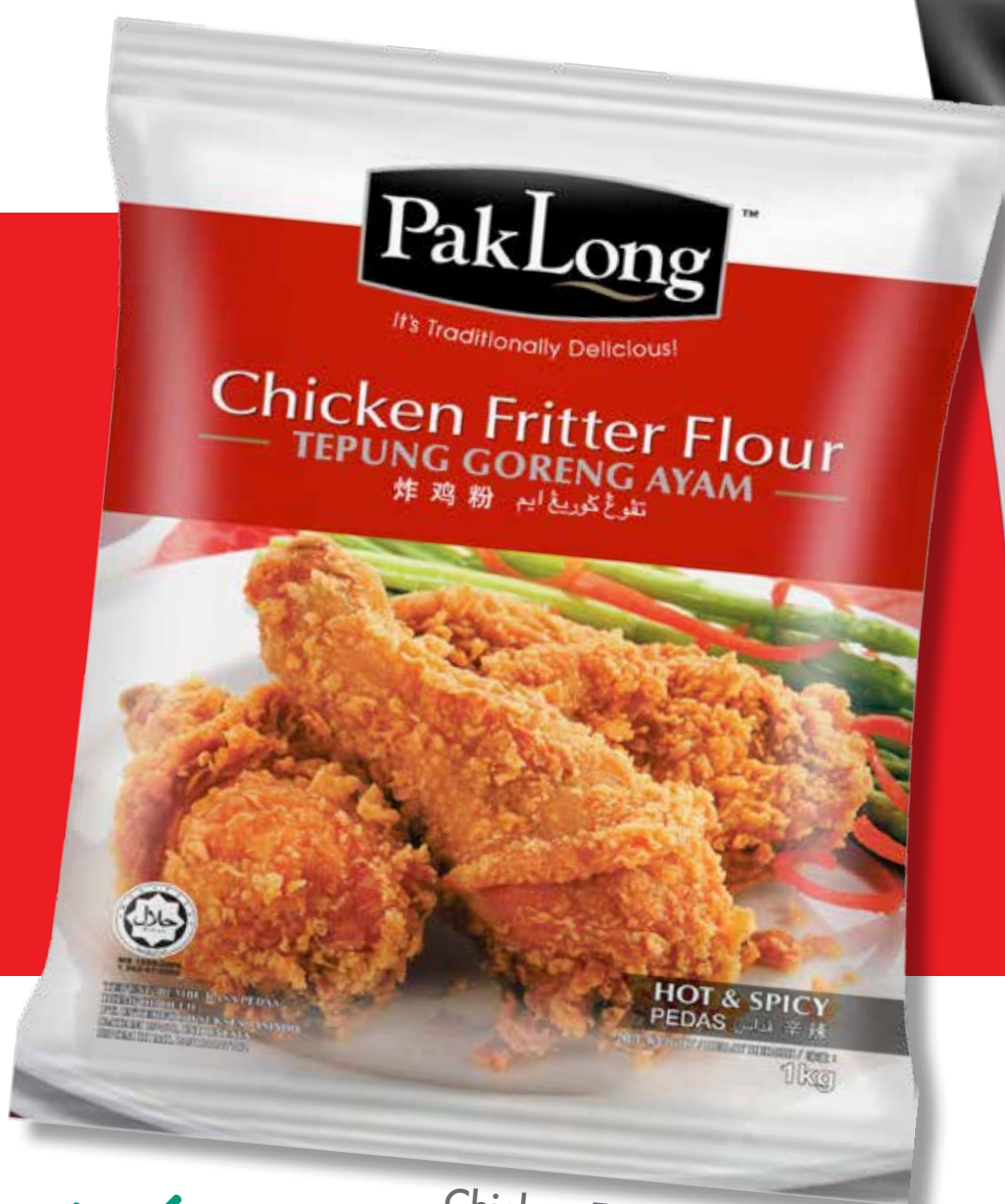
Chicken Fritter Flour