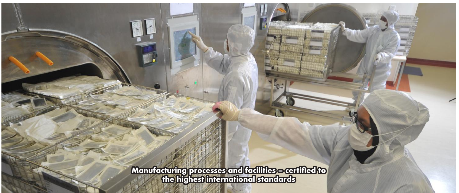
Manufacturing processes and facilities – certified to the highest international standards