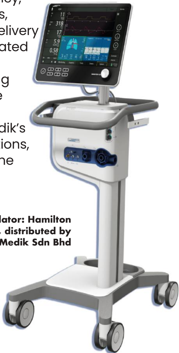
Ventilator: Hamilton Medical, distributed by Star Medik Sdn Bhd

Transparency, trustworthiness, dependable delivery and demonstrated wisdom in all decisionmaking – these are the attributes that define Star Medik’s central aspirations, now and into the future.