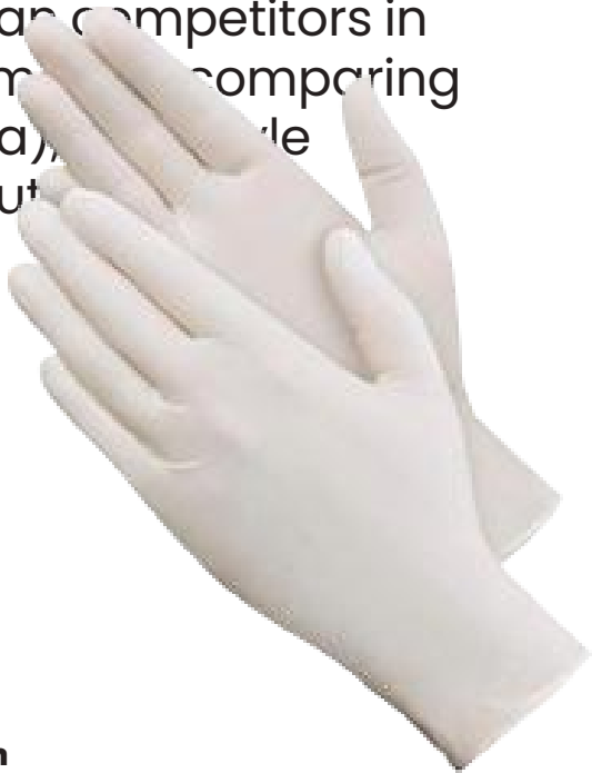
Premium Latex Examination Glove (Powdered)

Based on its survey, specifically, its VacuBlood® product is at least 4% to 25% lower in price than competitors in the local Malaysian market, comparing BD (USA), Puth (China), B. Braun (Germany) and Vacutainer (USA).