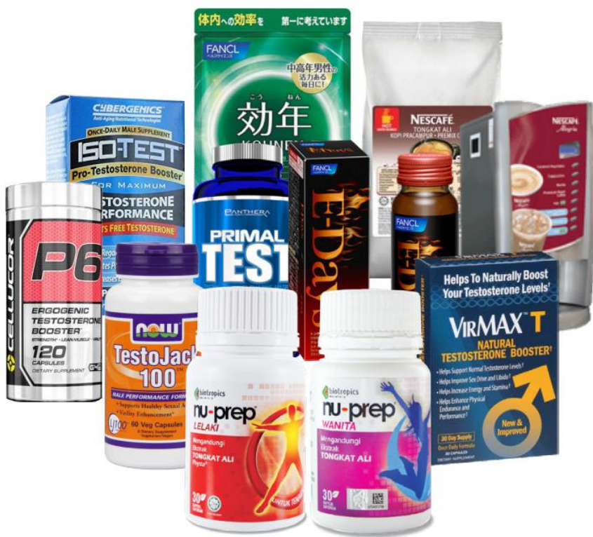
Biotropics diverse health products