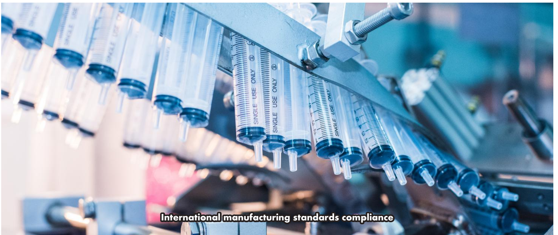
International manufacturing standards compliance