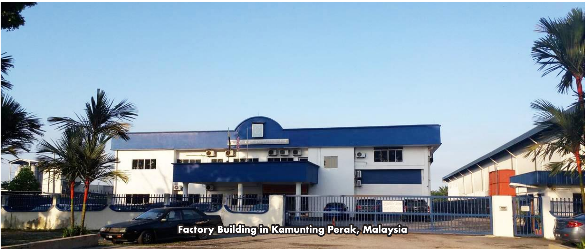
Factory Building in Kamunting Perak, Malaysia