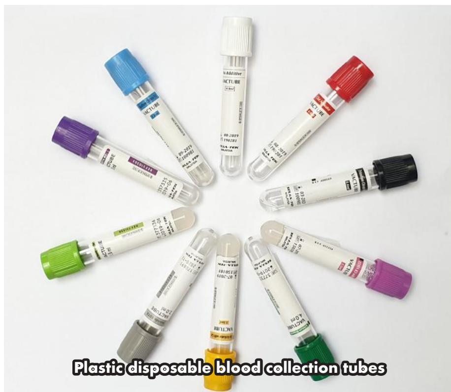
Plastic disposable blood collection tubes

STHSB's 10,000 sq metre manufacturing plant in Kota Damansara is in prime proximity to Kuala Lumpur City Centre