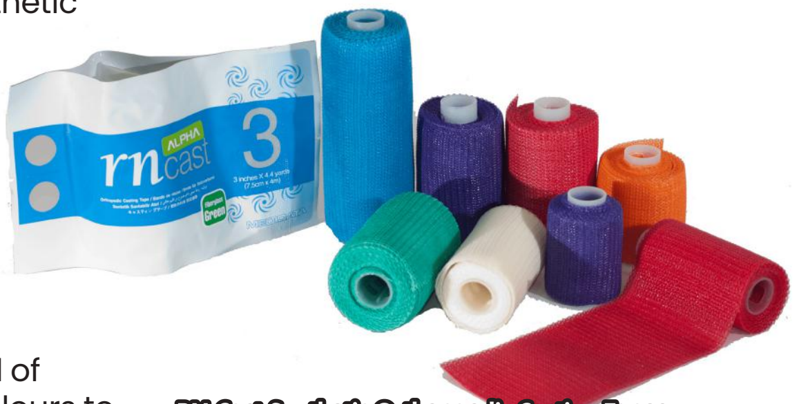
RN Cast Synthetic Orthopaedic Casting Tapes

RN Cast is a superior quality Synthetic Orthopaedic Fiberglass / Polyester Casting Tape with excellent rigidity, marvellous adhesiveness between layers, extraordinary mouldability, fast-setting and less resin migration for fracture management treatment. Medidata offer six types of Synthetic Orthopaedic Casting Tapes with different kind of characteristics and in various colours to cater to the market requirements.