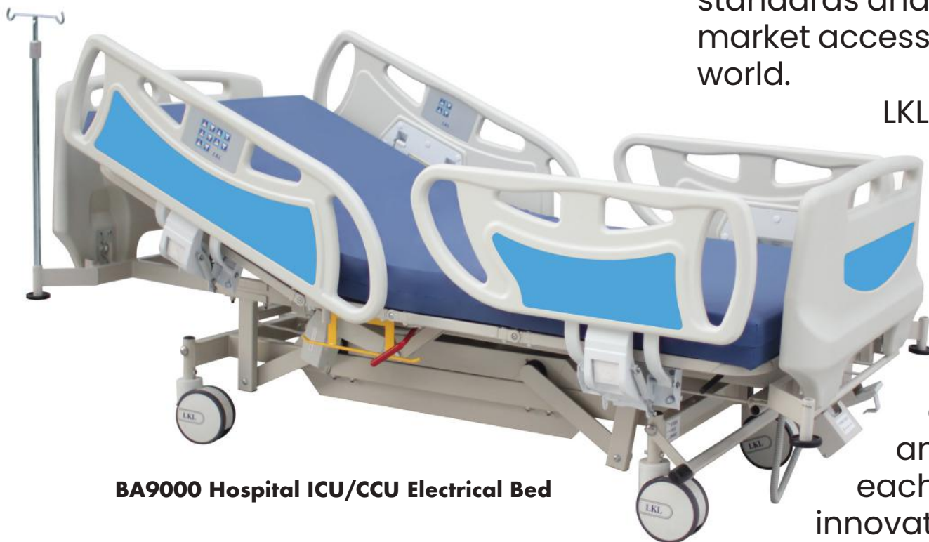
BA9000 Hospital ICU/CCU Electrical Bed

in strict compliance with international standards and have been approved for market access locally and around the world.