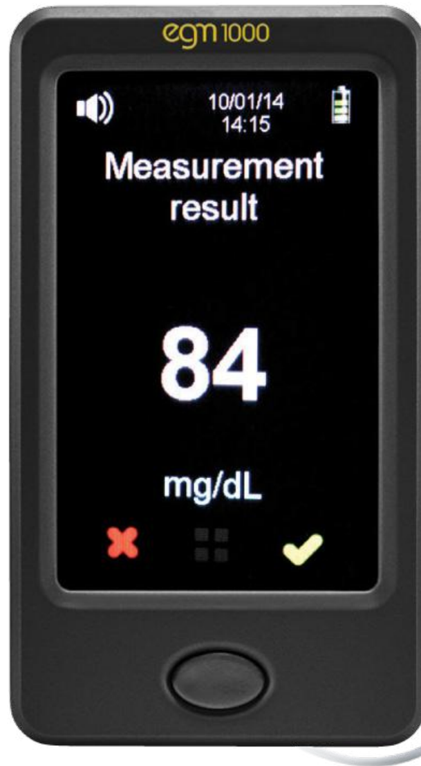
EGM 1000 Non-Invasive Glucometer

Star Medik products, services and solutions reflect the highest safety standards and reliability in providing the measurability, predictability and control inherent in Care Pathway Management. Focused on the future, let Star Medik's promise of innovative product development, continuous improvement, clinical need fulfilment and dependability place it first among your choices for high-quality ventilators and medical devices.