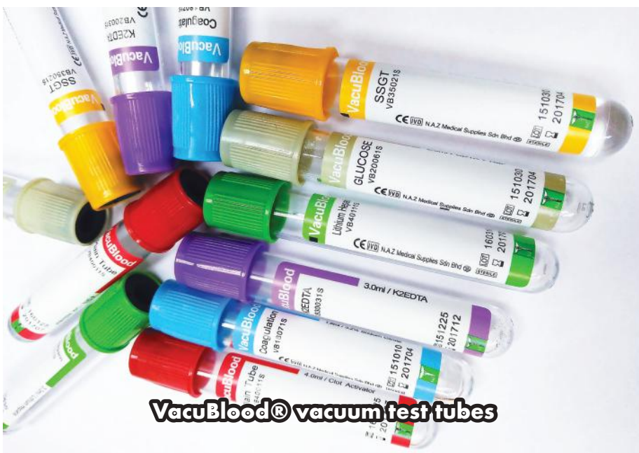
VacuBlood® vacuum test tubes

N.A.Z Medical Supplies provides medical essentials ranging from test tubes and glassware to PPEs, surgical masks and consumables.