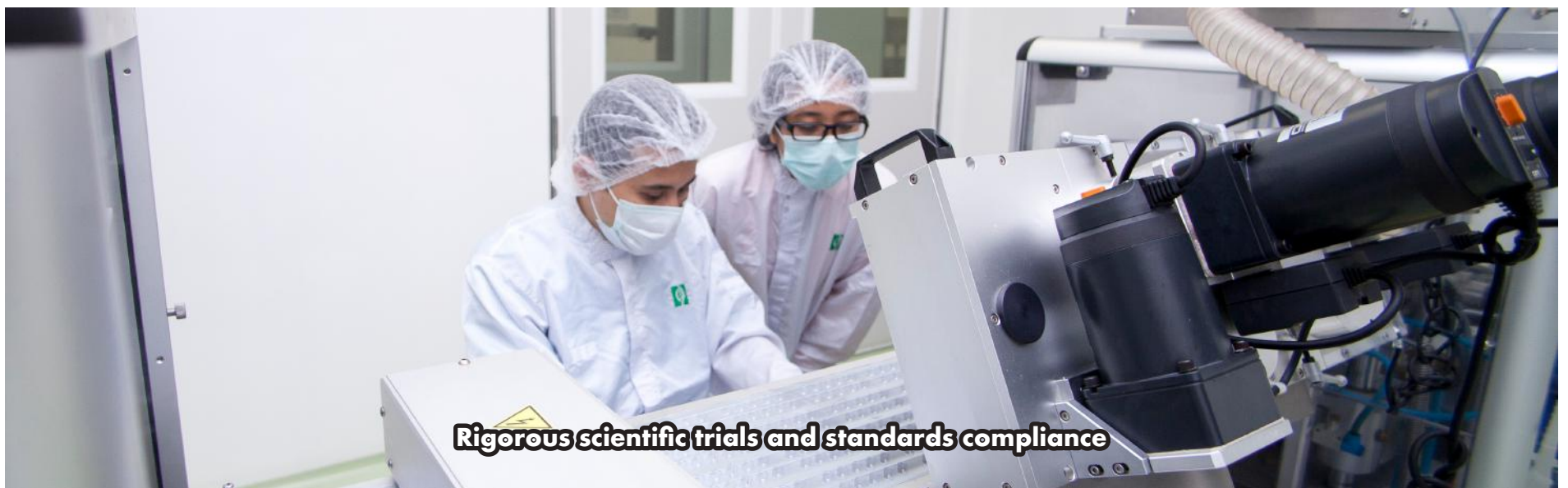
Rigorous scientific trials and standards compliance

history. BioKesum®, derived from the Kesum or Vietnamese Coriander plant or commonly referred to as Malaysian “laksa leaf” ( Polygonum minus @ Persicaria minor ) is a herbal extract clinically proven helpful for memory enhancement, relief of inflammation and as an anti-ageing preparation. It is self-affirmed GRAS (Generally Recognised as Safe) in the United States and is marketed for cognitive benefits and brain health.