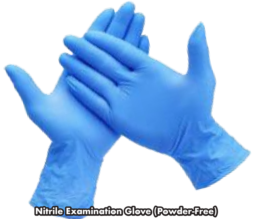
Nitrile Examination Glove (Powder-Free)

Equipped with four certifications, namely ISO 9001, ISO 13485, ISO 14001 and Good Distribution Practice for Medical Device (GDPMD), the company has established exemplary working procedures, besides always striving towards continuous improvement.