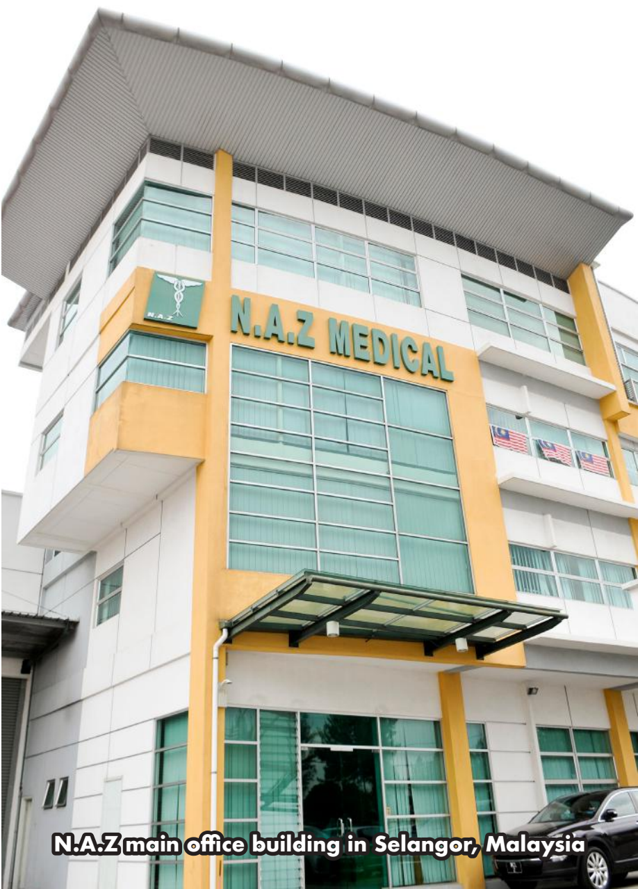
N.A.Z main office building in Selangor, Malaysia

The increasing use of disposable gloves in the healthcare sector for personal health safety has propelled the medical gloves market in recent times. Additionally, the outbreak of the COVID-19 pandemic and its emerging health threats has further hiked the demand for disposable medical gloves from both the general public and healthcare professionals, thereby boosting the market growth.