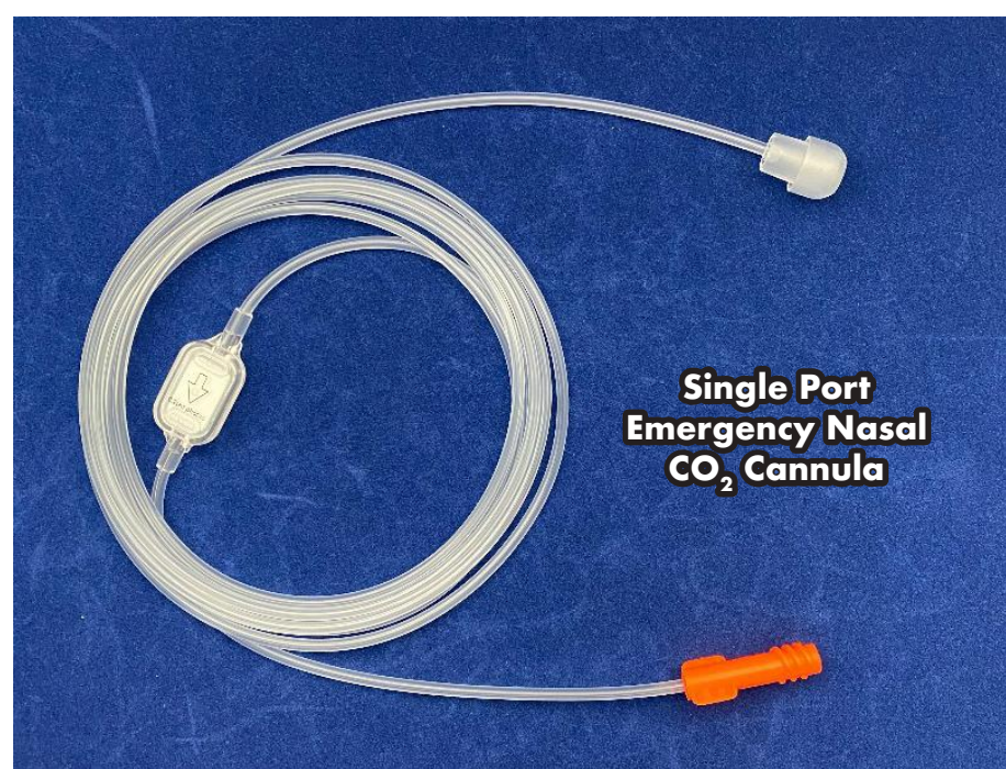
Single Port Emergency Nasal CO 2 Cannula

The company is fully committed to the design and development of quality capnography products in a bid to improve patient care.