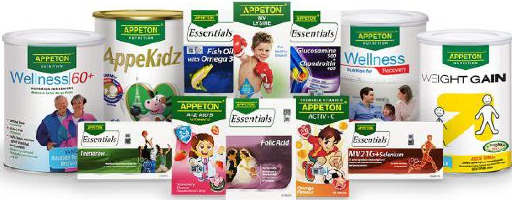
Appeton Product Line: Safe, Dependable, Quality

With familiar, trusted brands like Appeton, Axcel and Vaxcel, Malaysia manufacturer, Kotra Pharma embraces its goal of enhancing wellbeing at every stage of life.