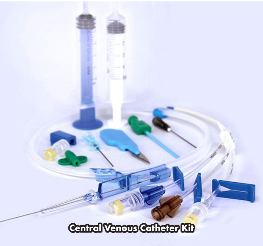
Central Venous Catheter Kit

Today, Welford's products are being used in more than 35 countries worldwide, including the United Kingdom, Austria, Netherlands, Australia, Hong Kong, South Africa, Saudi Arabia, UAE, Malaysia, Greece, Malta, Bahrain, Oman, Philippines, Indonesia, Thailand, Vietnam, Myanmar, Kenya, Nepal, Sri Lanka, Cyprus, Syria, Pakistan, Bangladesh, Mauritius, Morocco, Jordan, Uganda, Ethiopia, Tanzania and others.