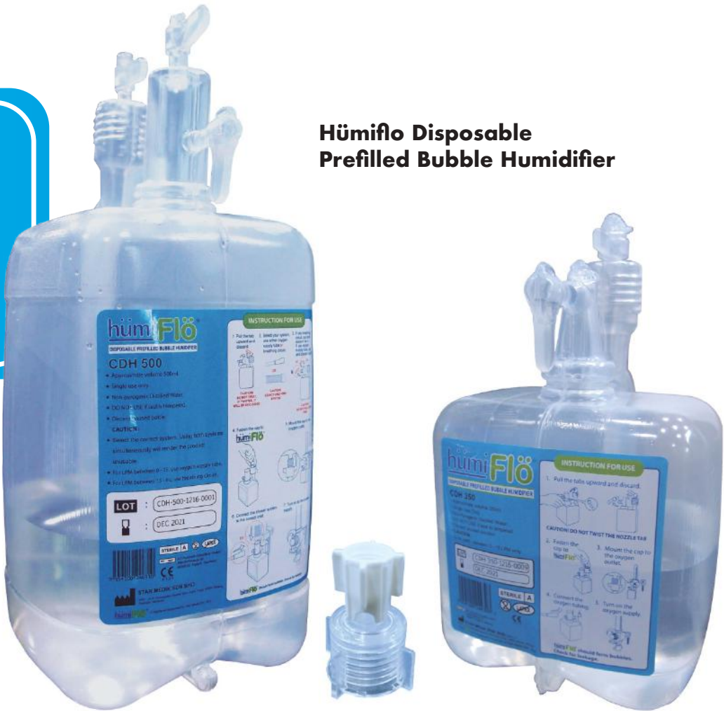
Hümiflo Disposable Prefilled Bubble Humidifier