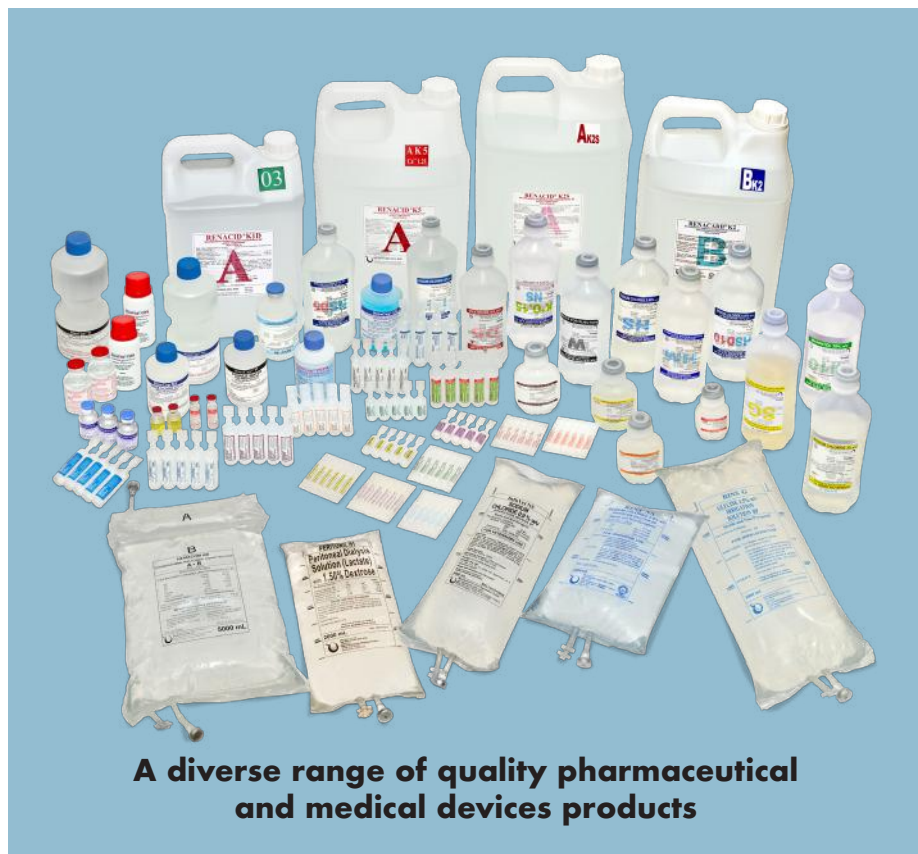
A diverse range of quality pharmaceutical and medical devices products

Patience, perseverance and high commitment to quality have propelled Ain Medicare Sdn Bhd (AMSB) to a position of prominence as a manufacturer of sterile and non-sterile pharmaceutical products.