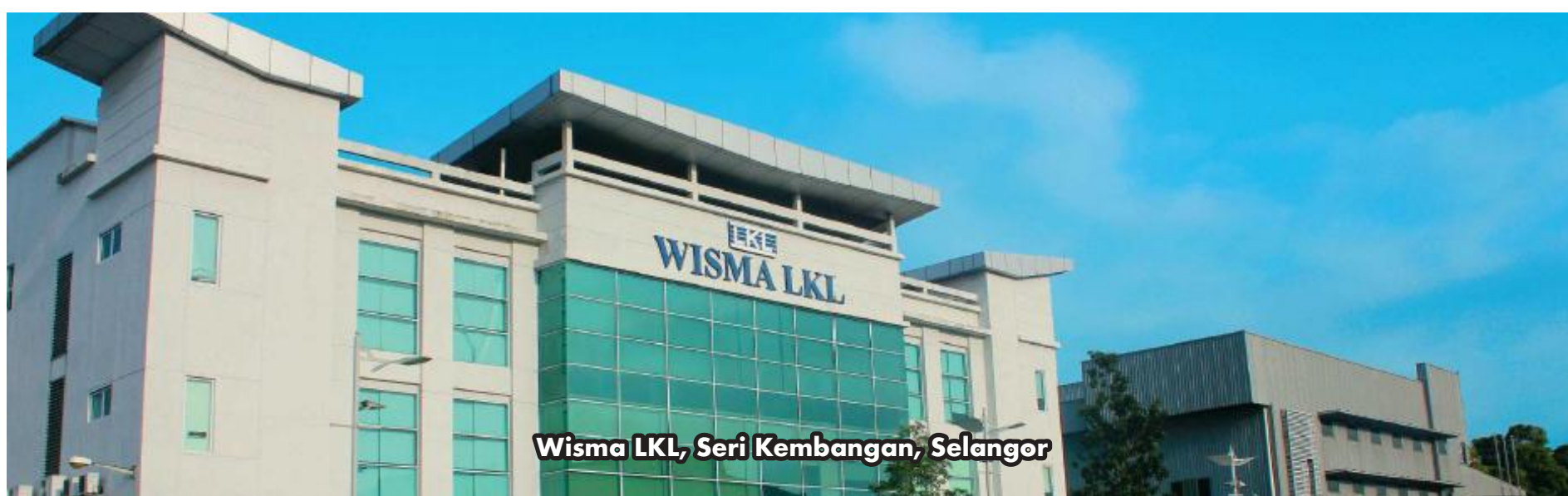
Wisma LKL, Seri Kembangan, Selangor

Another is the BA7001 Hospital Homecare Electrical Bed . This bed, designed and manufactured for comfort and quality, provides the best solution for home care support of bedridden patients. Features are designed to ease caregiver access and control of bed position.